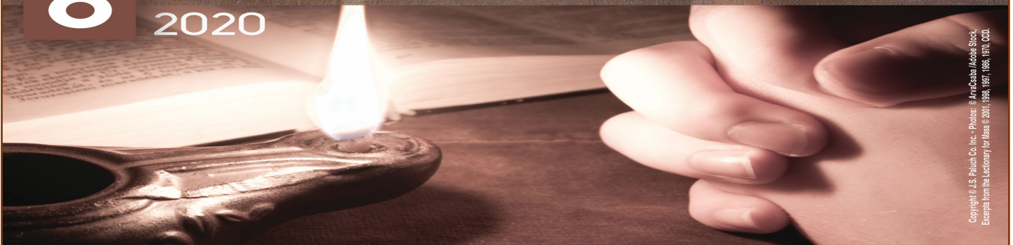
Copyright © J.S. Paluch Co. Inc. Excerpts from the Lectionary for Mass © 2001, 1989, 1997, 1988, 1970, CDO.